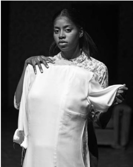
Crumbs from the Table of Joy