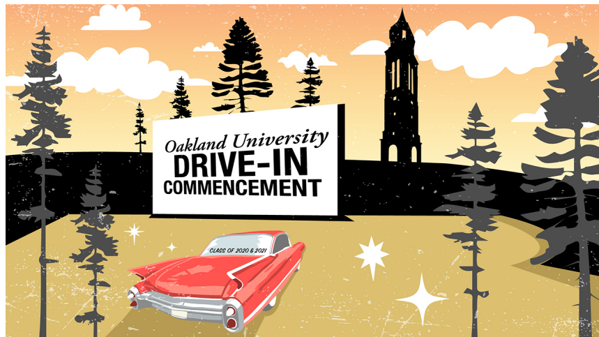
Illustration by Lily Stotz

Oakland University will celebrate its fall 2020 and spring 2021 graduates during drive-in commencement ceremonies May 13-15. The events will combine traditional elements of commencement with adaptations to protect the health and safety of attendees.