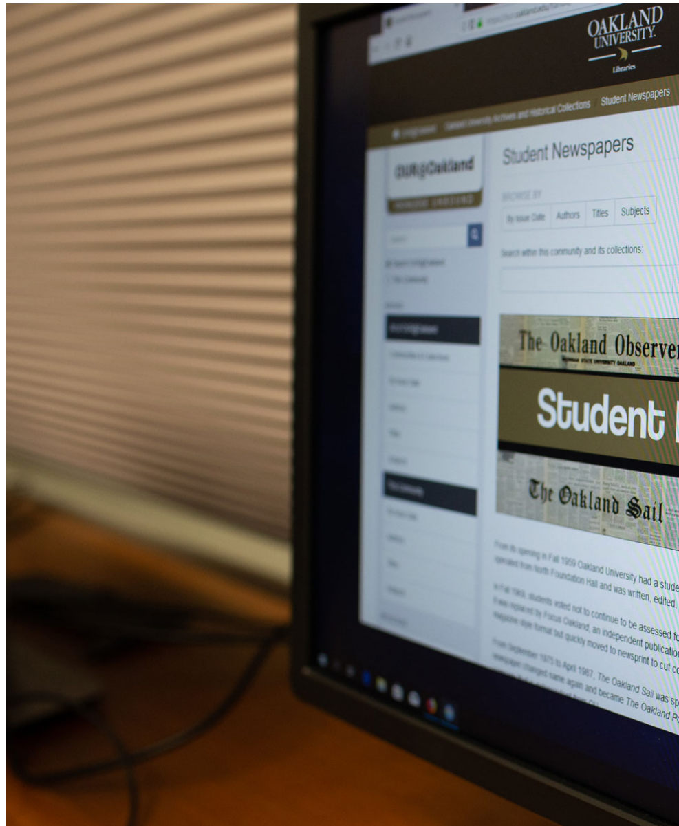
Homepage of the digitized student newspaper archive

A gift from the family of a former library professor financed a project to digitize more than 5,000 issues of OU's student newspaper.